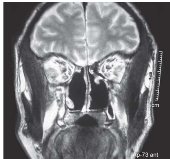
Fig. 2: Postoperative coronal magnetic resonance showing complete removal of the tumors